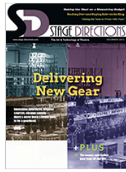
December 2015 Digital