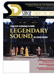
January 2016 Digital