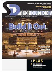
November 2015 Digital