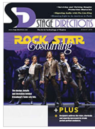
August 2015 Digital