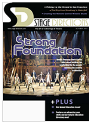
October 2015 Digital