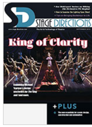
September 2015 Digital